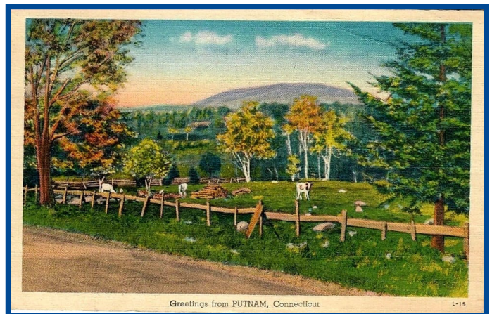
Greetings from PUTNAM, Connecticut